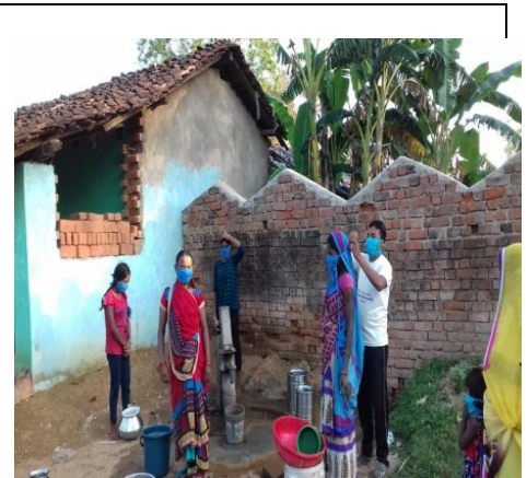
Sanitation and Social distancing near Wells and Tubewells