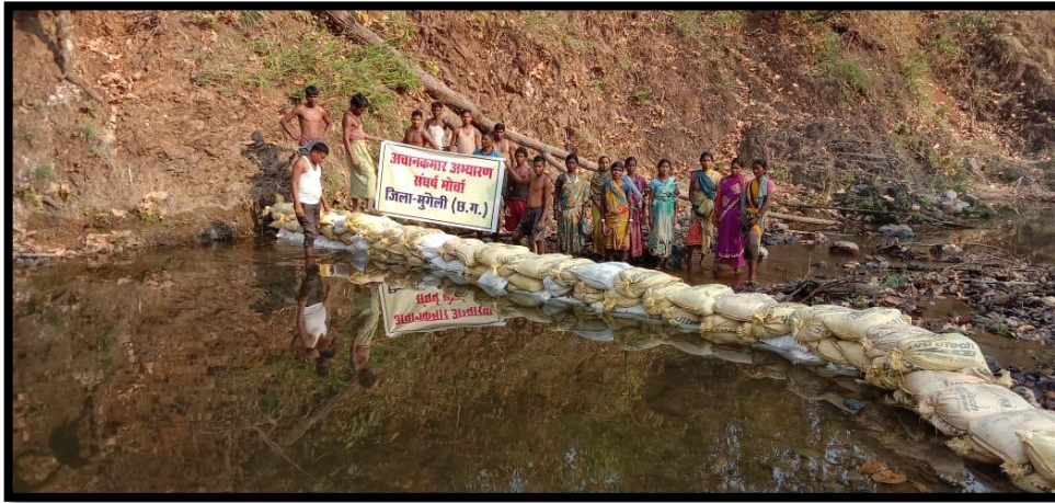
Water Harvesting in Rajak-Achanakmar as Coivd releif Work