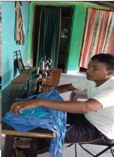
Mask Preparation and Distribution By Staff