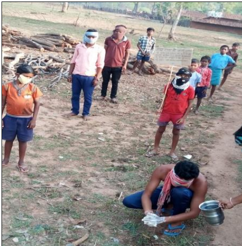
Social Distancing and Hand washing

Development Through People's Initiatives